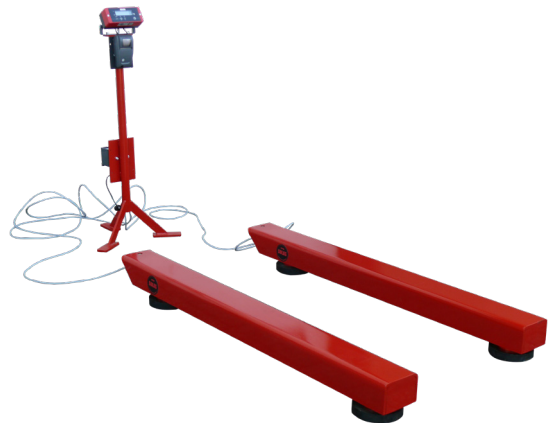
** The RWB DE model with tripod