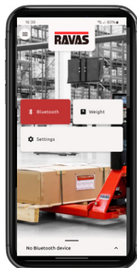
RAVAS Indicator App